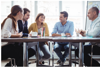
Executive Briefings www.greystone.net/professional-development

Learn more at www.greystone.net/education