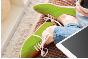
The Greystone Journal www.greystone.net/blog