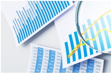
Case Studies www.greystone.net/resources