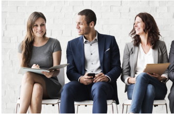
GreyMatters eNewsletter www.greystone.net/greymatters